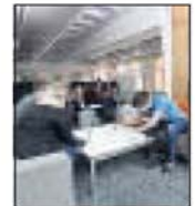
New leaf... £24m library